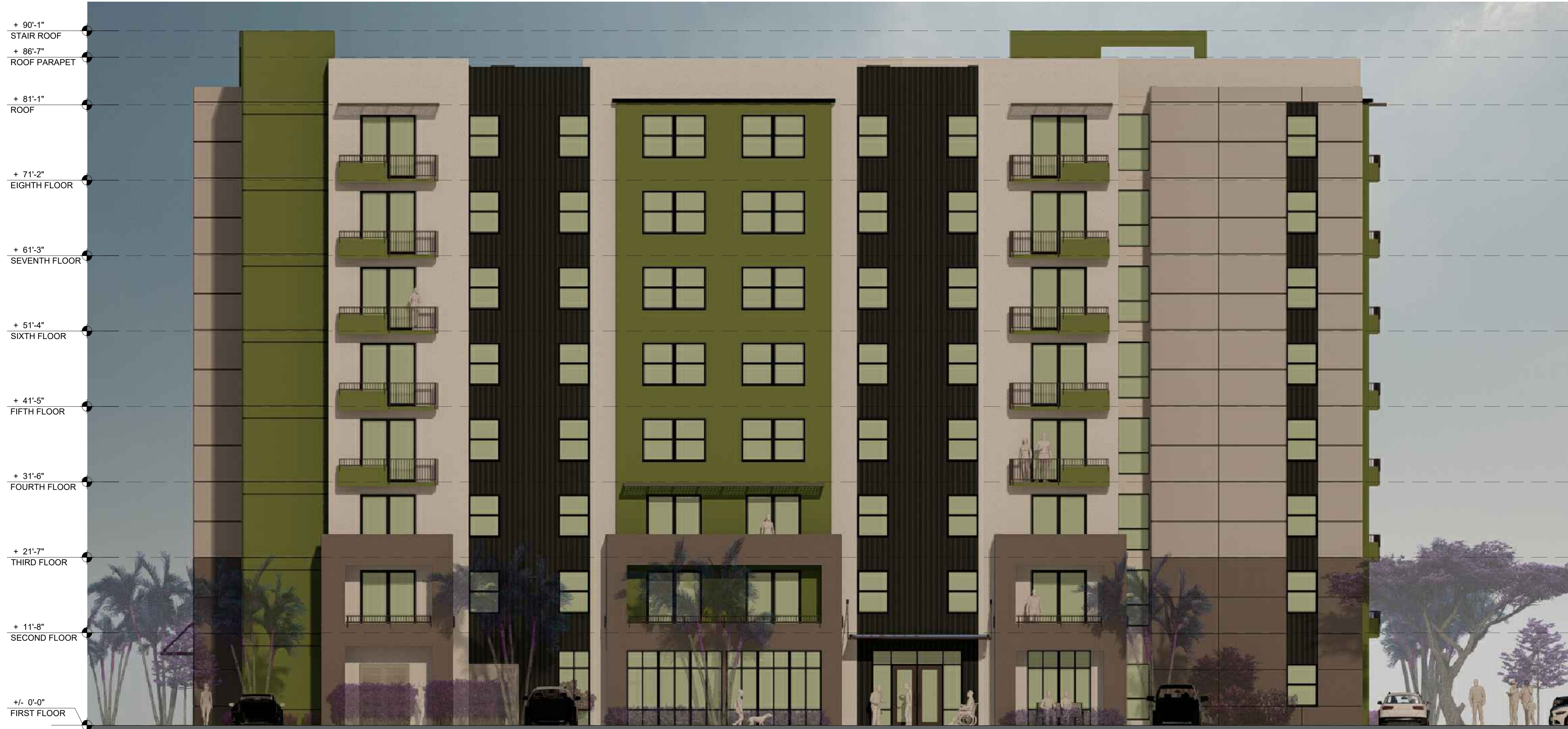
C1 ESAT ELEVATION 1/8" = 1'-0"

A VIOLATION OF THE LAW FOR ANY PERSON, UNLESS ACTING UNDER THE DIRECTION OF A LICENSED ARCHITECT TO ALTER THESE PLANS AND SPECIFICATIONS. THIS DOCUMENT CONTAINS PROPERTY INFORMATION AND SHALL NOT BE USED OR REPRODUCED OR ITS CONTENTS DISCLOSED, IN WHOLE OR IN PART, WITHOUT THE PRIOR WRITTEN CONSENT OF GALLO HERBERT ARCHITECTS ARCHITECTS. COPYRIGHT 2018 GALLO HERBERT ARCHITECTS